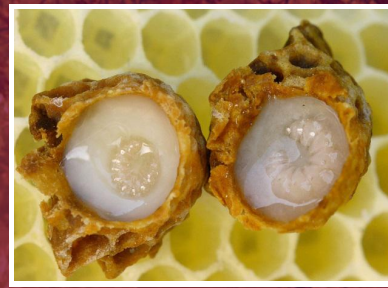
Bee larvae surrounded by Royal jelly